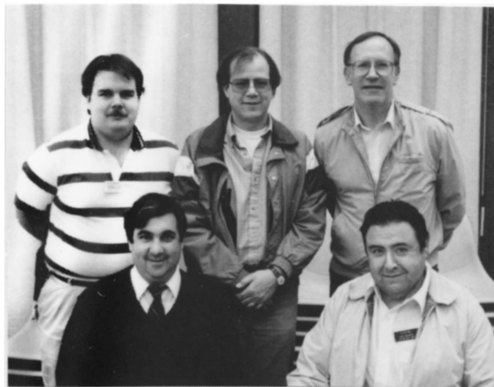
NEW SCCARA MEMBERS

Although I haven't received news of any upgrades this month, I know there must have been some. I went to JD's class meeting on Feb 20 and watched while they tested their current novice class. While some just used the code test for practice, three of them passed